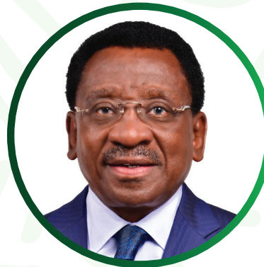
H.E. James Orengo Governor Siaya County