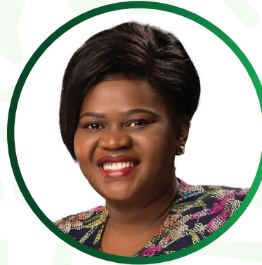
H.E. Gladys Wanga Governor Homa Bay County